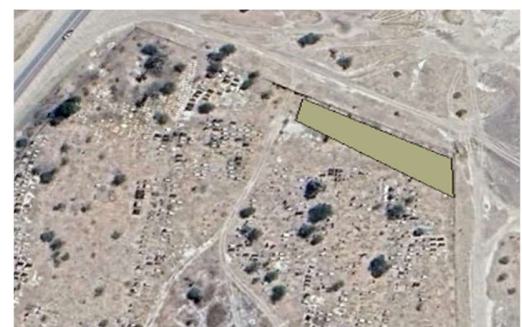
Figure 4-Gravel material fill (g6/7), grey area) at Oniipa Cemetry