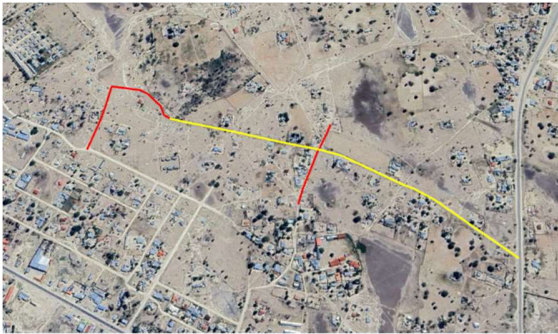
Figure 1-Road 1 (light blading = 1,0km (yellow) ,track paths =0,5km (red))