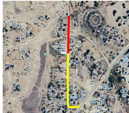
Figure 2-Road 2 (light blading =0,3km (yellow), track paths = 0,6km (red))