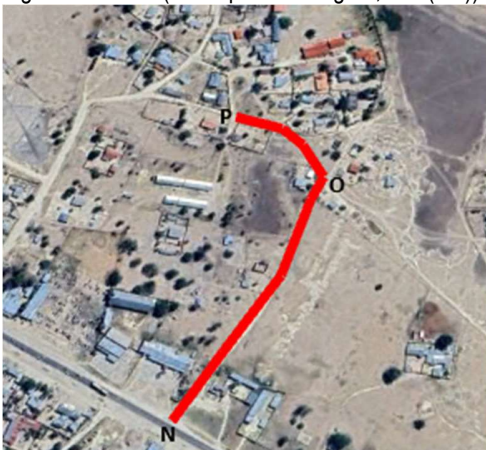
Figure 6-Road 4 (Track path blading =0,4km (red))