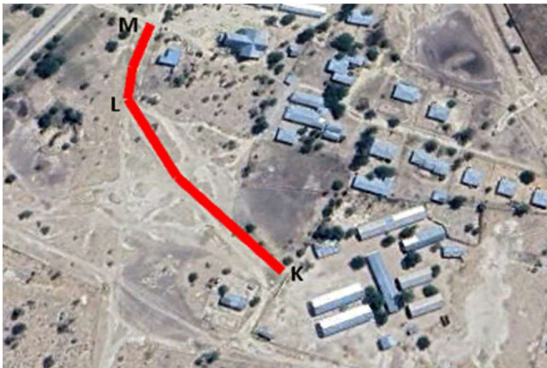
Figure 3-Road 3 (Track path blading =0,2km (red))